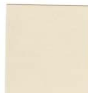
White Pearlescent LRV 67.84 3-VHZ-60 Not a Stock Color