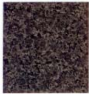
Black Granite 4-LBG-80