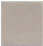
Mica Platinum 4-OPT-50