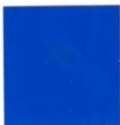
DYB Blue LRV 10.06 3-DYB-80