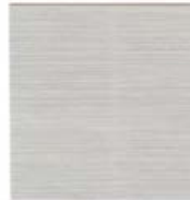
Hairline Aluminum LRV 16.32 4&3-HLA-80