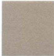
Metallic TSZ Silver LRV 32.00 4-TSZ-80