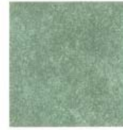
Patina Copper 4-PSS-30