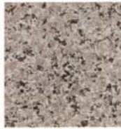
White Granite 4-LWG-80