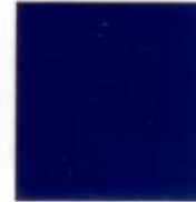
AUB Blue LRV 3.25 4-AUB-50