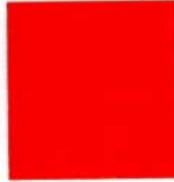
BTR Red LRV 11.57 4&3-BTR-50