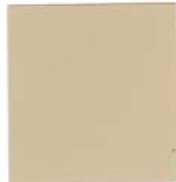
ETT Tan LRV 47.67 3-ETT-30