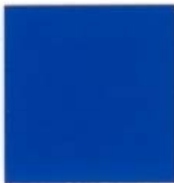
CBU Blue LRV 8.69 3-CBU-50