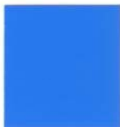
ABE Blue LRV 23.73 4-ABE-70