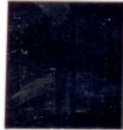
High Polished Aluminum LRV 0.88 3-HPA-80