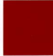
JLR Red LRV 5.44 4-JLR-50