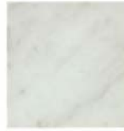
White Marble 4-LWM-80