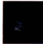
BLX Black LRV 0.89 4&3-BLX-30