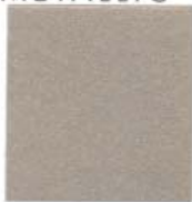
Metallic BSX Silver LRV 30.94 4-BSX-30