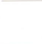
SDX White Metallic LRV 83.31 SDX-30