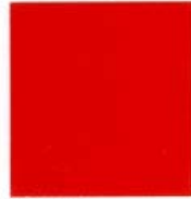
STR Red LRV 12.95 3-STR-75