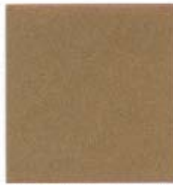
Medium Bronze Metallic 4-MBX-30