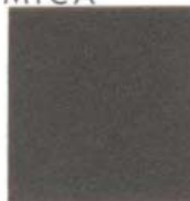
MICA Mica MZG Grey LRV 7.95 4-MZG-50