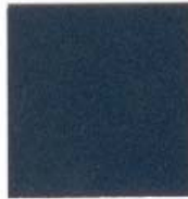
SLX Blue Metallic LRV 5.20 SLX-30