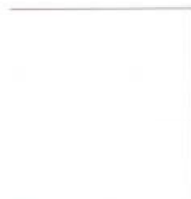
SAW White LRV 80.62 3-4-SAW-G75