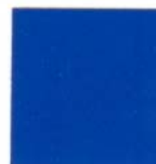
Blue Metallic LRV 8.96 3-CBZ-80 Not a Stock Color