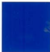
CFB Blue LRV 7.24 3-CFB-70