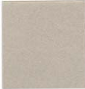
Metallic TBX Silver LRV 38.65 4&3-TBX-30