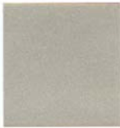
Anodic Clear 4-MNC-30