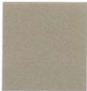
Gold Metallic LRV 28.59 CHX-30