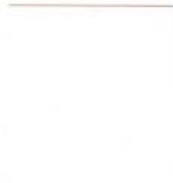
RVW White LRV 96.34 4-RVW-G45