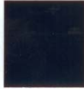
CNC Charcoal LRV 4.20 3-CNC-30