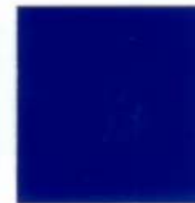
HYB Blue LRV 4.20 4-HYB-30