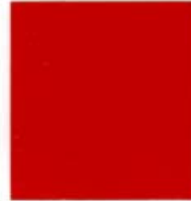
TOR Red LRV 9.06 4-TOR-70