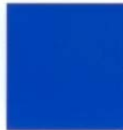
MBU Blue LRV 10.59 4-MBU-30