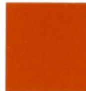
Red LRV 11.33 3-MRT-70